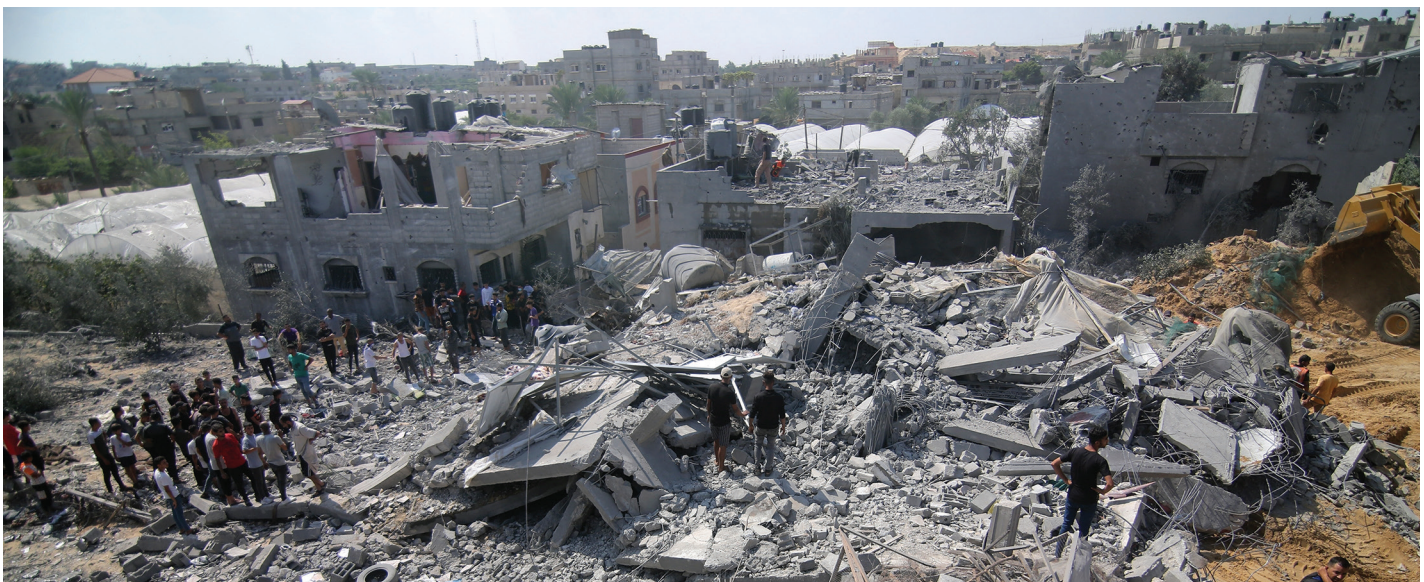
Iron Dome rocket interceptions of Hamas Rockets in Southern Israel during a night attack on Ashdod City, Israel. (left) Art installations for the release of Hamas hostages in front of the Tel Aviv Museum of Art, Tel Aviv, Israel. (right) Palestinians search for survivors after an Israeli airstrike in Rafah southern Gaza Strip, on October 12, 2023. (bottom)