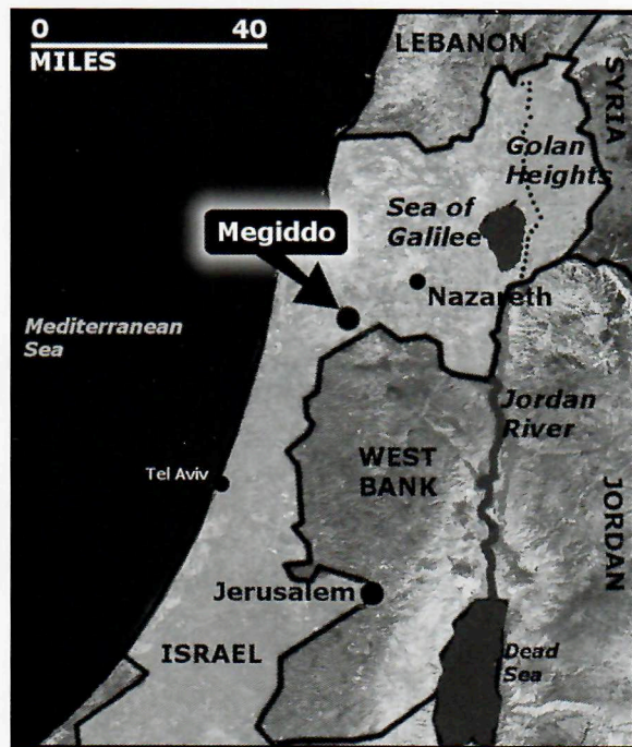
Map of Megiddo which is approximately 65 miles northwest of the holy city, Jerusalem.

ing on the battle scene. Such numbers could blanket the skies, blotting out the sun causing “A day of darkness and of gloominess...” (Joel 2:2). Awesome! Nearly beyond belief. Makes the D-Day invasion of WWII seem like child’s play.