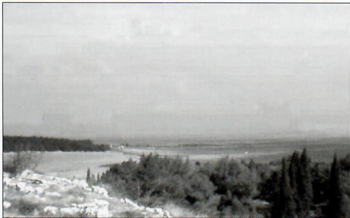
Looking northeast of Jezreel Valley from Mt. Megiddo: many historical battles were fought here and it will be the staging area for the Antichrist's armies in the coming Tribulation.

Armageddon is the site northwest of Jerusalem quietly awaiting its modern role in the momentous battle of the