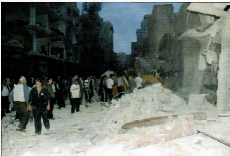
Damascus, Syria , building rubble after a car bomb detonated Friday, October 26, 2012, killing five people and wounding more than 30. Following this, another car bomb and sporadic fighting, thousands of protestors poured out of the mosques to demand President Bashar Assad's ouster.

It is clear he believes other countries are training and funding terrorists: "The success of the political work is linked to pressing the countries which fund and train the terrorists, [and] confiscate weapons into Syria to stop such acts," the president said, in a meeting in Damascus with