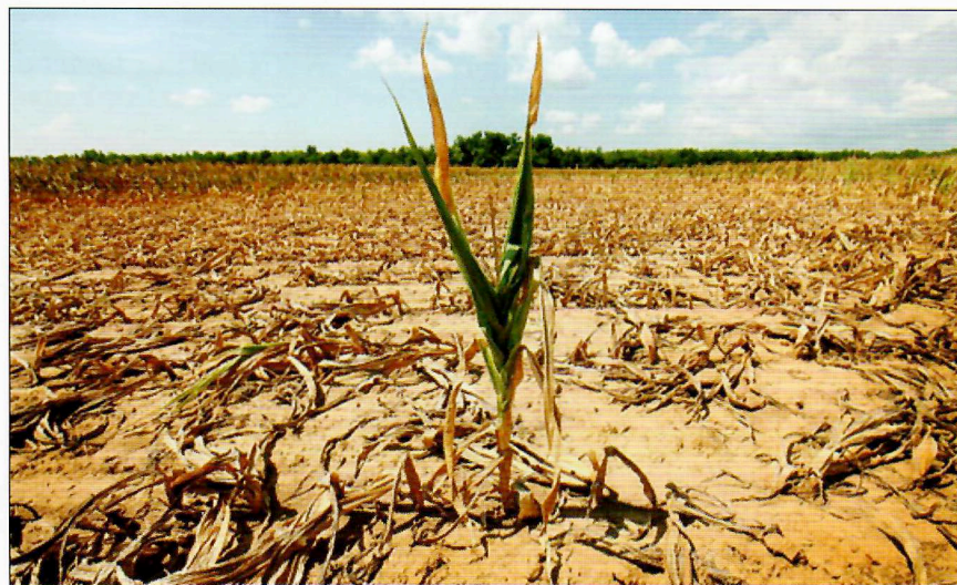
Corn crops in Illinois suffered severely during the 2012 drought. Economists estimated the total losses due to the drought of 2012 would top $20 billion. pionline.com