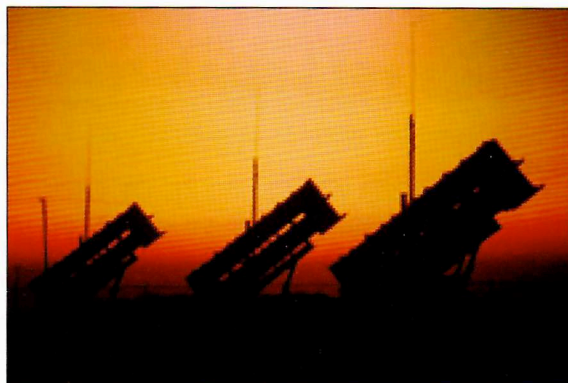
Patriot Missile Battery on watch.

The book of Revelation is profound prophecy beckoning us with its awesome and often mysterious imagery. And history shows since this book was written around 96 A.D. of “... things which must shortly come to pass ...” (Rev. 1:1), the final fulfillment of the vast majority, if not virtually all, of its graphic predictions is yet to happen . But this is evident only if we carefully let the Bible interpret itself!! (II