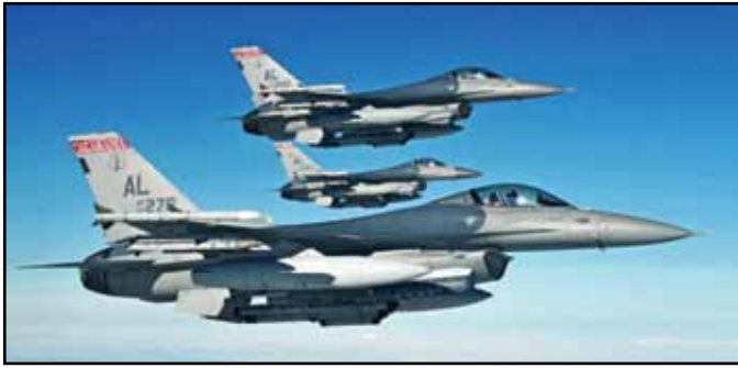
F-16 Fighting Falcon commonly referred to as “Viper” by its pilots, is a single-engine fighter pilot. The current US Military budget cannot afford to replace the aging ‘Vipers’ due to massive budget cuts. washingtontimes.com

768,000 pages were published in the Register! Of that total, the Obama administration has published 481,827 pages. 11