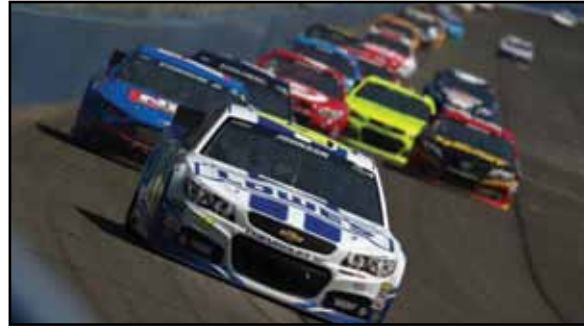
Modern 550 horsepower chariots dazzle the crowd. foxsports.com

ballooned to 93 public holidays dedicated to it by A.D. 50 under Emperor Claudius. The 93 Roman state-sponsored sports holidays a year sounds like a lot. It is.