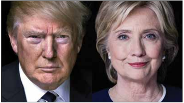
The US 2016 Presidential election: Trump the Outsider vs. Clinton the Insider. cnn.com

Although her turnouts at rallies are minuscule compared to Trump rallies and trails far behind in social media hits, she has lead in the national polls against Trump from the outset. However, with no press conferences in 277 consecutive days and sparse campaign stops in recent weeks, coupled with ongo-