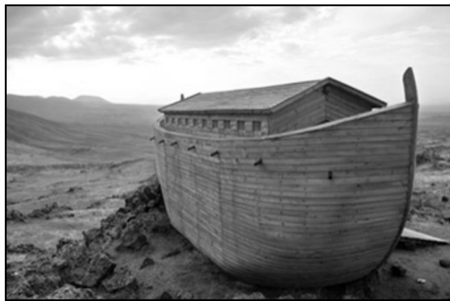
Noah’s Ark: the booth Noah and his family occupied during the Feast of Tabernacles.

But notice the expression “pitch/pitched” is used dozens of times in Scripture referring to a tent but never once when referring to a booth. This indicates a tent is not a booth in the Biblical sense ( KJV mistranslates