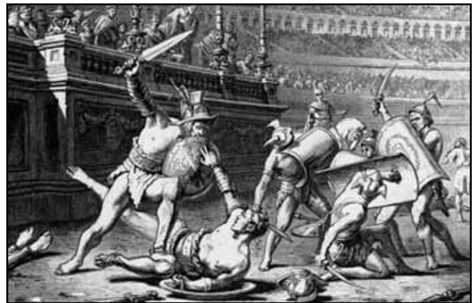
Roman mass entertainment became increasingly violent as depicted in this 19th century engraving of gladiatorial combat in the Roman Colosseum Arena.

In ancient Rome state sponsored sporting events