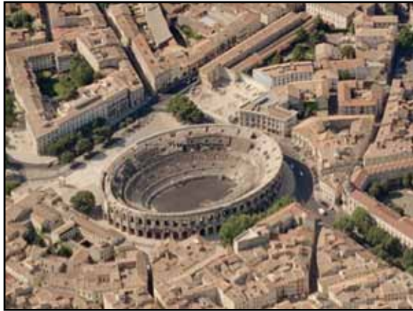
The Roman Colosseum was dedicated in A.D. 80 with 100 days of games.