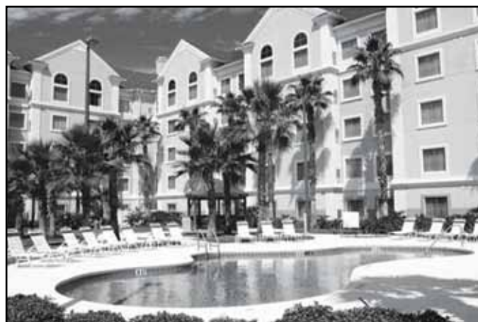
Modern Tabernacle widely used during the fall Feast of Tabernacles. aol.com

Again, where does the Law command booths