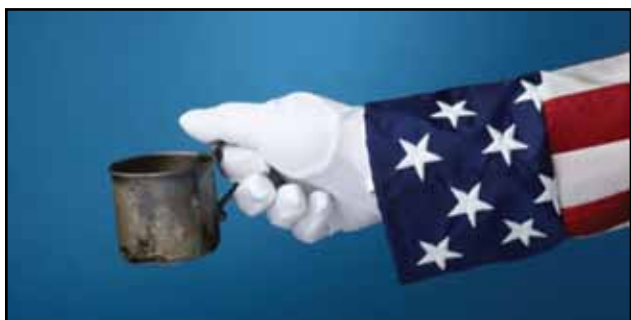
America’s National Debt has nearly doubled since President Obama took office January 20, 2009.

The “fundamental transformation of America” via “Hope and Change” Mr. Obama promised has him