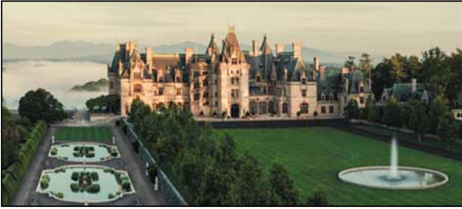
The Biltmore attracts thousands each year. George Vanderbilt began construction in 1889 and the estate was completed in 1896.

completely of the property while alive, giving all to his heirs, then live “in poverty” while his sons and daughters live high on their inheritance. But we can also assume the children are to learn some financial savvy so their inheritance will sustain them, not just entertain them for the moment.