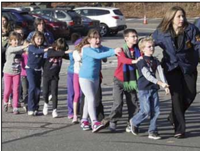
Children escorted to safety at Sandy Hook Elementary after the mass shooting on December 14, 2012.

“Responsible,” the word loses its meaning in a politically correct society which stands for nothing absolute. Where there is no right or wrong in a “tossed salad” society of competing cultural values, there will be neither a coherent national identity nor national sovereignty. Personal responsibility will be relinquished and so will personal freedom.