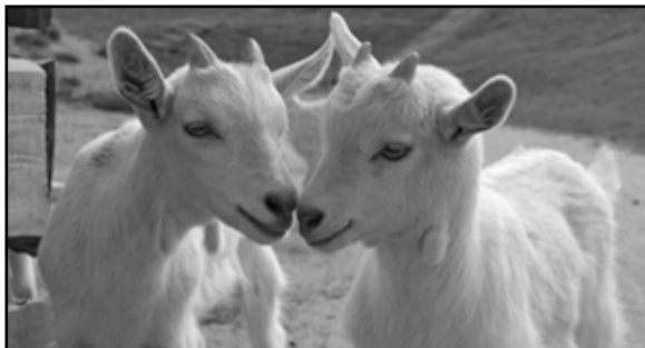
The sin offering and the scape goat. pcog.org

Neglected fact #2: The word “Atonements” (SEC 3725) comes from a root word (3722) meaning