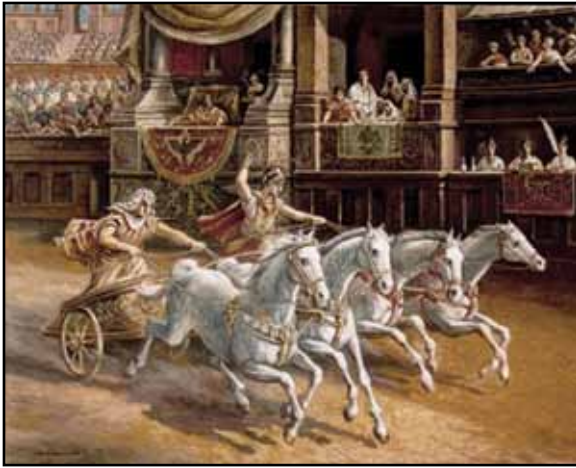
Horsepower of a bygone era. Two-horsepower chariots at the Circus Maximus, Ancient Rome.