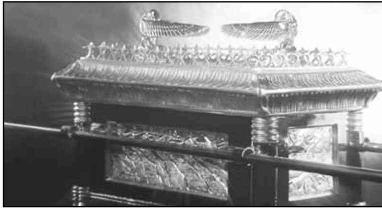
Satan was a covering cherub over the mercy seat. shoebat.com