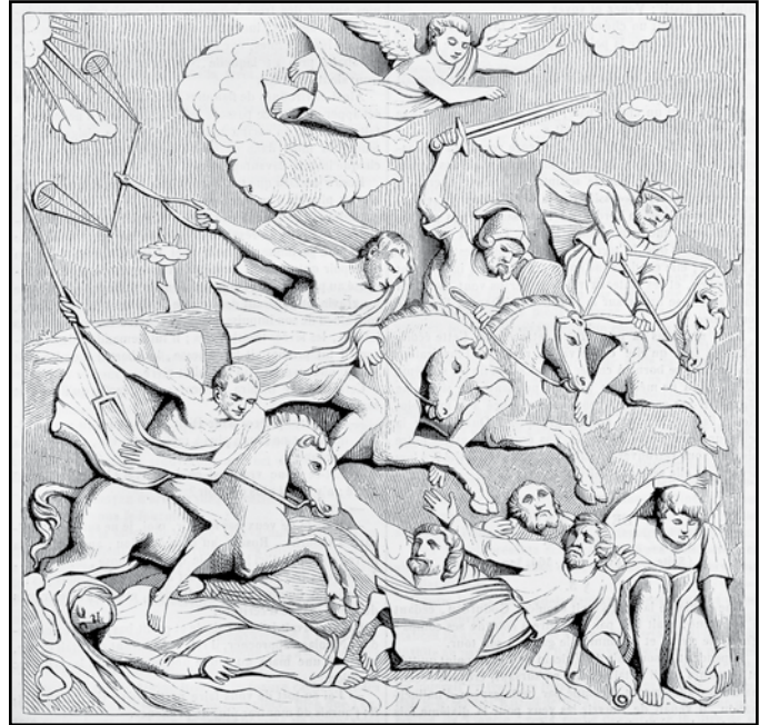
The four horsemen of the Apocalypse have been depicted in many different ways over the years by various artists.

(2). The 1st angel of the 7th seal sounds and “...a third part of trees was burnt up and ALL green grass was burnt up” (Rev. 8:7). No doubt this will strike a devastating blow to the world’s food supply. However, Yahweh does not indicate additional deaths resulting! We must take this at face value, assuming no more are killed or perhaps He considers the number is insignificant compared to the horsemen’s toll.