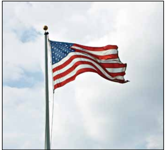
The United States of America is just one of many nations that needs to be saved.

▪ If a man and woman have intercourse, they must