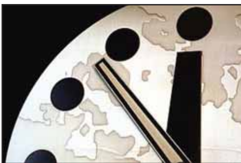
Symbolic Doomsday Clock now set at six minutes until midnight as of January 14, 2010.

“For the first time since atomic bombs were