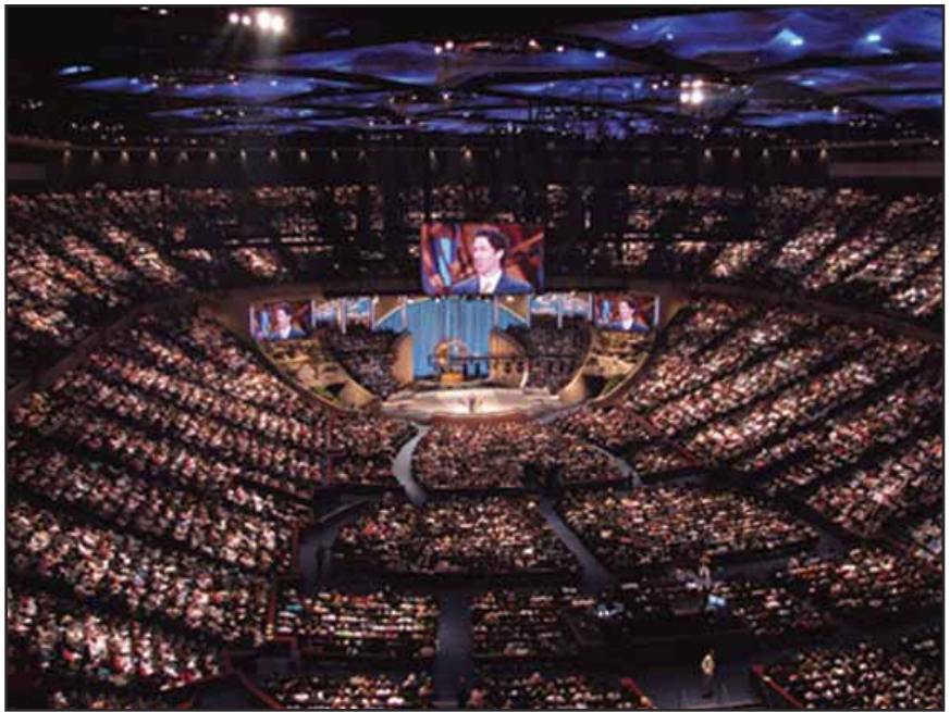
Dynamic minister delivers moving message to vast church audience. Megachurches today resemble stadiums verses traditional churches.

Can they ALL be right? Or is there A "right" one; an actual "True" Church, A "True" Assembly, or Congregation? Is there an original one the Messiah founded... still in existence?