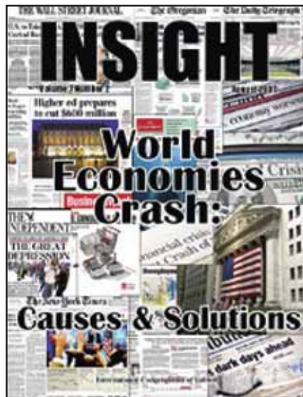
INSIGHT Volume 7 Number 2