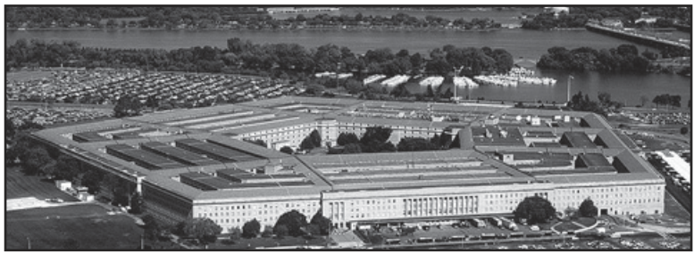
The Pentagon houses nerve center of all U.S. military operations.

There is a real clock ticking toward a global ren-