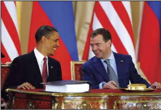
President Obama and Russian counterpart Dmitry Medvedev sign the new Strategic Arms Reduction Treaty (START) in Prague on April 8, 2010.

dropped in 1945 , leaders of nuclear weapons states are cooperating to vastly reduce their arsenals and secure all nuclear bomb-making material.” (my emphasis).