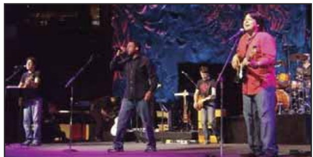
Saturday night live! Rock band entertains megachurch worshippers. ( crossroadsofconway.org )