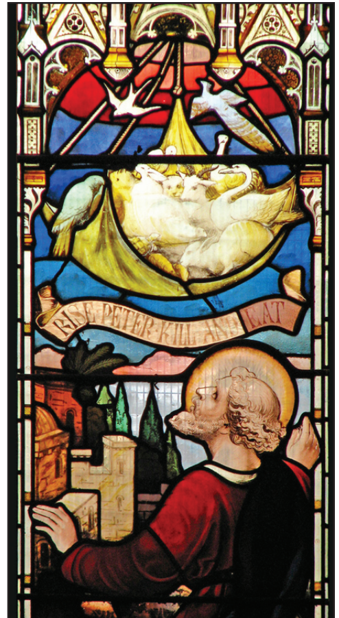
Acts 10:28, Peter's vision: "...but God [YHWH: Yahweh] hath showed me that I should not call any man common or unclean." By Peter's own admission, this is the meaning of the vision. vanderbilt.edu

On the surface this verse appears to do away with the law of unclean foods, "...nothing unclean of itself..." And also appears to say that unclean things are strictly a matter of opinion. Are unclean things really just what each person decides? Is it only a kind of social "relativism" that each can decide for himself; no absolutes in this matter? Not at all.