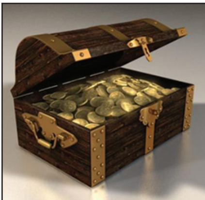
Zacchaeus was known for giving away half of all his goods.

These and countless other scriptures leave no doubt that Zacchaeus was blessed for giving half of ALL he possessed to the poor. He lost nothing, but gained physical wealth, and eventually had the opportunity for salvation itself (Luke 19:9).