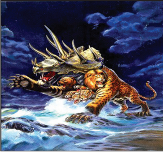
The Beast has Ten Horns (Rev. 17:3, 12). The Ten Horns are Ten Kings, who destroy Babylon (v. 16). Bible Prophecy shows the following nations (The Ten Horns) destroy Babylon: Ararat, Minni, Ashchenaz and the Medes. (Jer. 51:27-28).

tary leader (“Who is able to make war with him?” Rev. 13:4) who uses great oratory —persuasive, maybe charming [“...a mouth speaking great things...” v. 5].