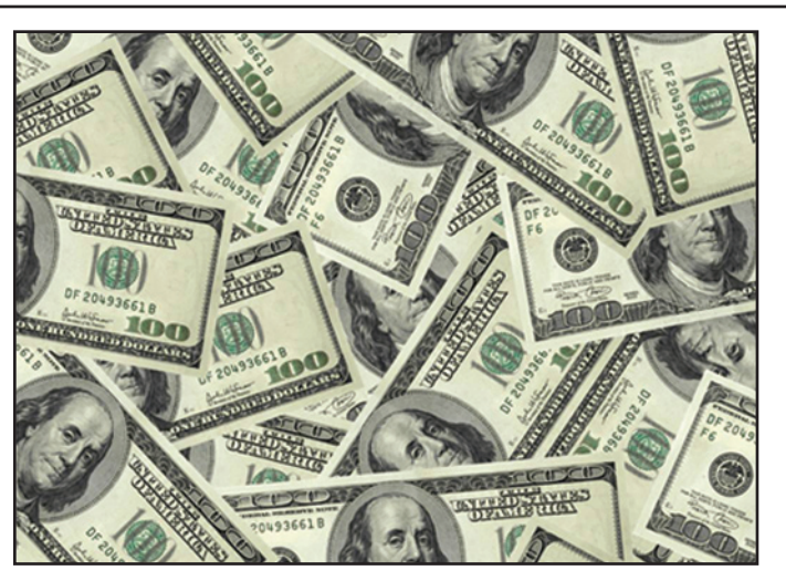
Too much paper money, not backed by silver or gold, chasing too few goods, equals runaway inflation. The average inflation rate of 2008 was 3.85%, which is calculated from the Consumer Price Index which is compiled by the Bureau of Labor Statistics. worldpress.com

lions, GM and Chrysler executives were justifiably mystified by a harsh and inequitable Congress during their public testimonies aired on CSPAN. Congress railed on them piling on regulations and demanding wide-ranging restructuring tied to the requested $21 billion from the Troubled Asset Relief Program, (TARP money so called). Some felt Congressional hypocrisy had reached an all-time high!